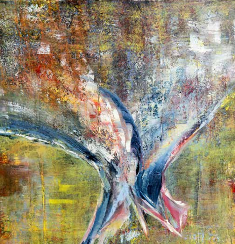
Painting: © Reinhold Spratte