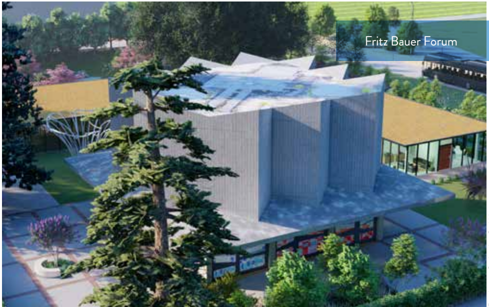
Fritz Bauer Forum