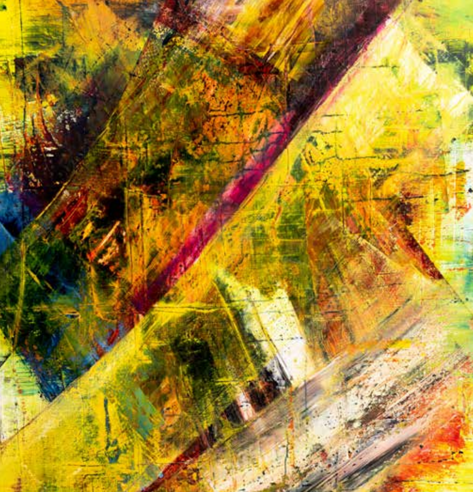
Painting: © Reinhold Spratte